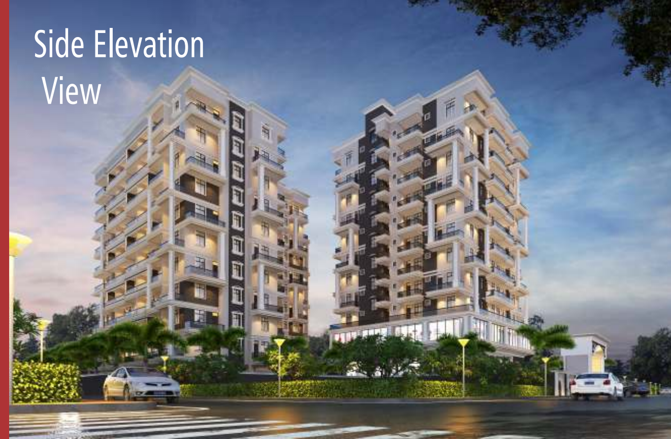
Side Elevation View