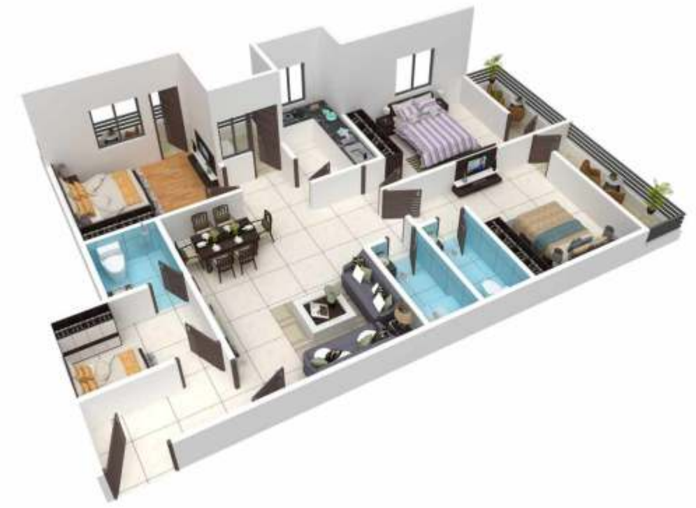
BLOCK - B FLAT NO.7 TYPE - 3 BHK