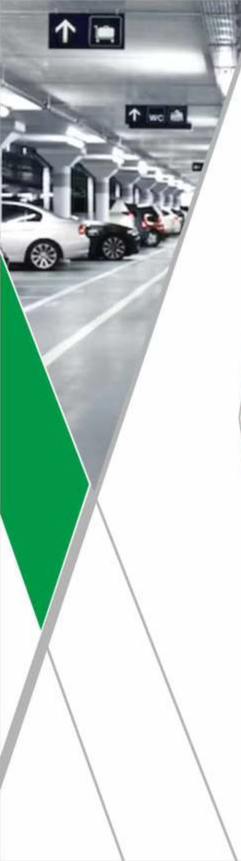
BASEMENT PARKING FLOOR PLAN – BLOCK A & B