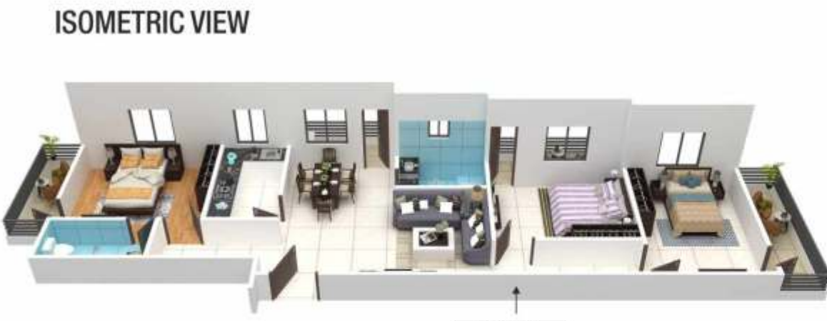
BLOCK - A FLAT NO.3 TYPE - 3 BHK