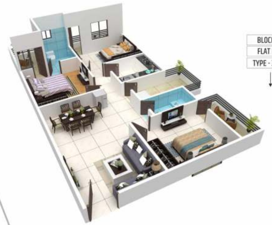
BLOCK - B FLAT NO.1 TYPE - 3 BHK