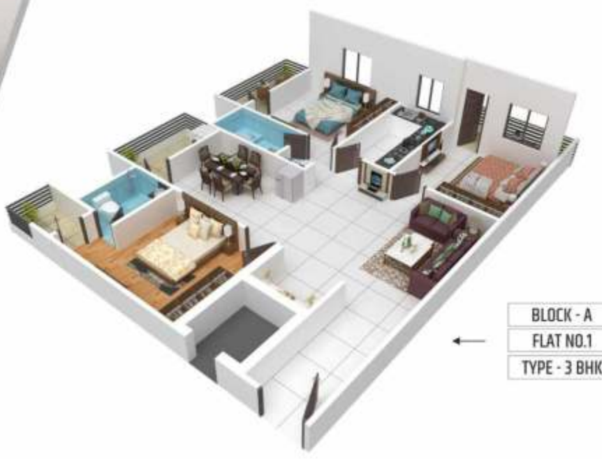
BLOCK - A FLAT NO.1 TYPE - 3 BHK