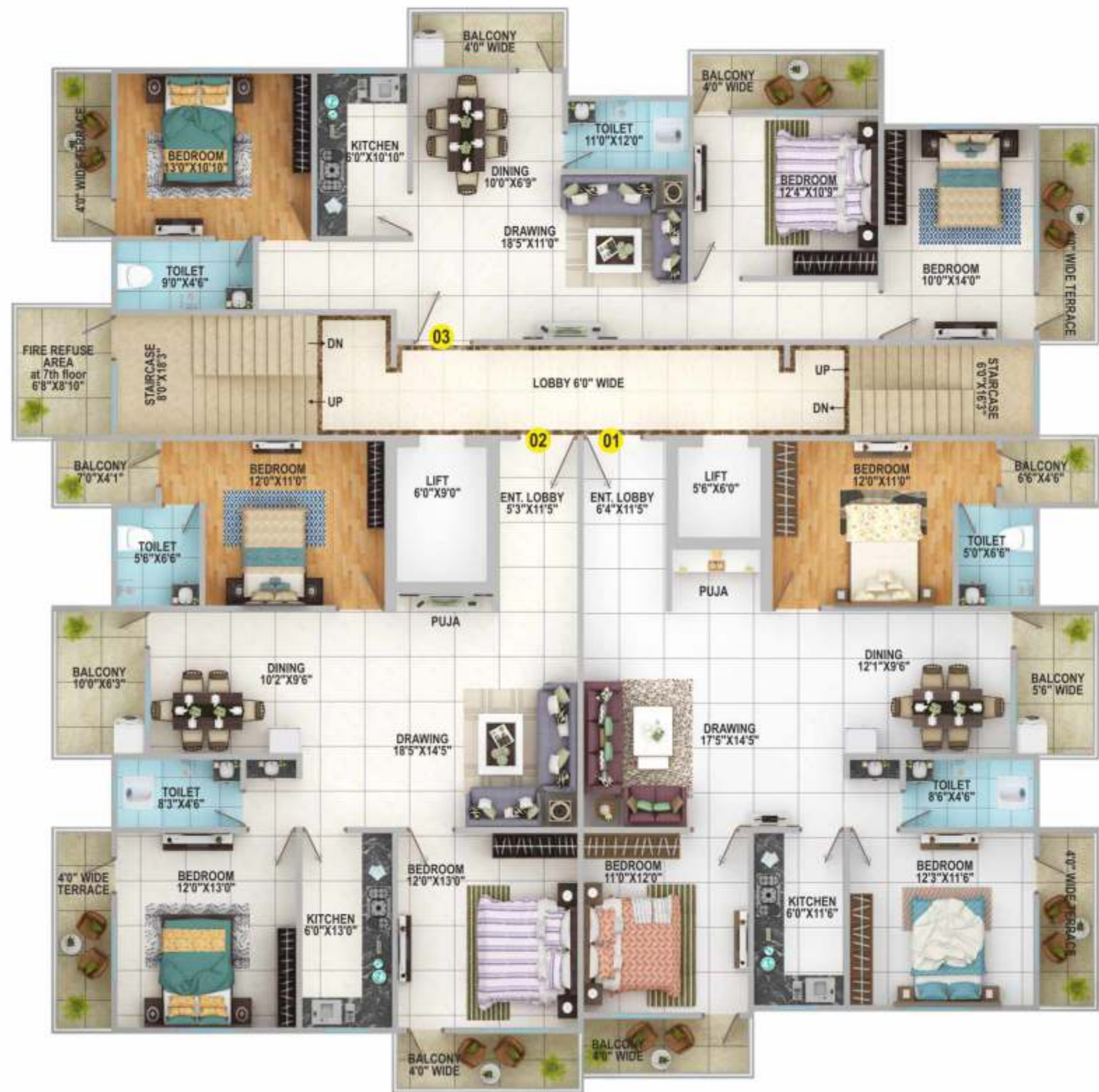
BLOCK – A, TYPICAL FLOOR PLAN (1st, 3rd, 5th, 7th, 9th)