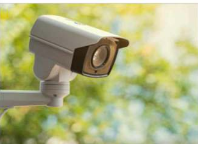
24x7 CCTV SECURITY