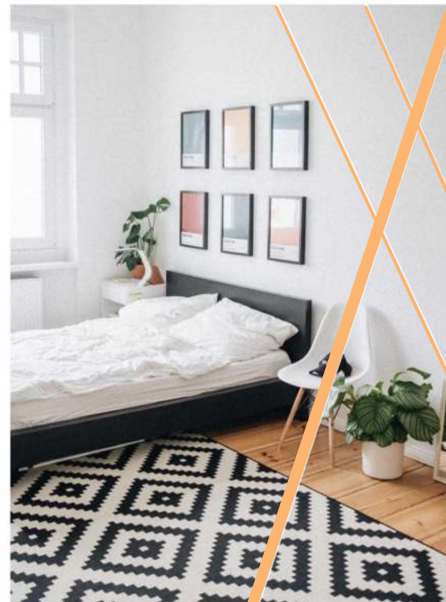
BLOCK – A, TYPICAL FLOOR PLAN (2nd, 4th, 6th, 8th)